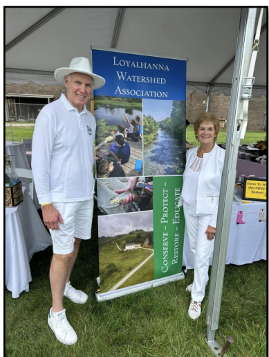
Westmoreland Croquet Club Tournament