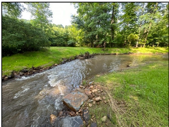
View of the modified mudsill constructed along Mill Creek in Waterford.

Despite what seemed like an endless summer of hiccups, including significant rainfall events and surprise threatened/endangered species, LWA and partners successfully completed several restoration projects in the upper watershed reaches to improve the water quality and in-stream habitat of two area waterways and a lake.