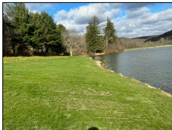
Shoreline restoration along Donegal Lake.

Efforts to assist the PA Fish & Boat Commission with improvements at Donegal Lake over the past several years continued this summer with the completion of lake shoreline restoration work - the first of its kind for LWA. Modified mudsills were installed along 600 feet of shoreline to provide stability and erosion protection near the existing boat launch area. A safe slope for recreationists to reach the water is now in place. In addition, the riparian area was re-planted with over 200 native shrubs and trees thanks to volunteers from First Energy, and a no-mow buffer area will be utilized to protect the restored bank. This unique project was made possible through a grant received from the PA Lake Management Society. As with all of our past stream restoration projects, we would like to thank our incredible partners from the PA Fish & Boat Commission, Western PA Conservancy, Westmoreland Conservation District and John Hardiman Excavating for working with Josh to improve our watershed.