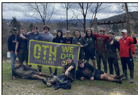
Over the Hill Challenge