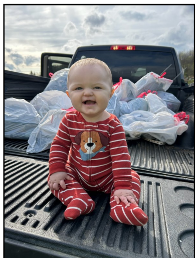
Great Ligonier Valley Cleanup