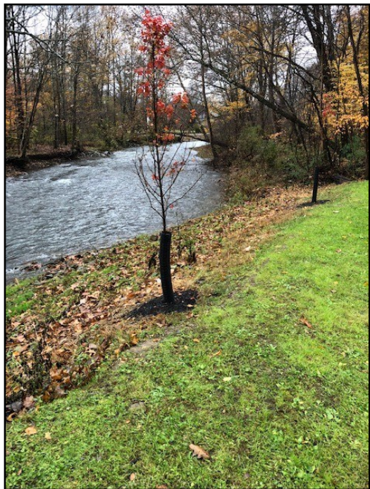
More than 1,100 feet of riparian buffer areas were newly planted along area waterways.

In 2021, the Loyalhanna Watershed Association (LWA) embarked on an ambitious project to re-assess over 100 miles of streams within the Loyalhanna Creek Watershed. The purpose of this effort was to further examine the health of these streams that were identified as “restoration priorities” from the original assessment plan completed in 2005. One common impact to stream health observed on practically every stream segment from this assessment was riparian buffer habitat loss, which led to the development of a new pilot effort by LWA to provide assistance to landowners with property along these key waterway segments.