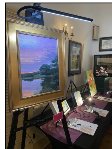
Art Auction Benefit