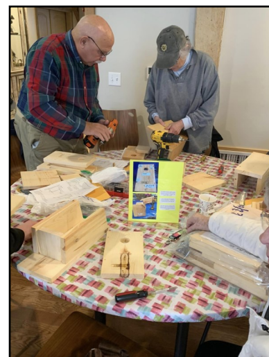
Bluebird Society Workshop