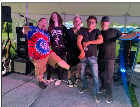
Harvest Market Dinner & Dance